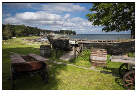
Lahemaa National Park

As of the 25 th of July, with well over a month left till the beginning of the Congress, 580 participants have already registered, and more are being added daily. The pre-meeting of the Congress, i.e. the Advanced STI Course, also has 60 registrants (and counting). The social programme is, likewise, proving very popular, with a great number of bookings for both the Tallinn Sight-Seeing Tour and the Day Trip to Lahemaa National Park, and 115 ballet tickets already bought.