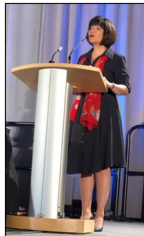
Ginette Petitpas Taylor, the Minister of Health, at the Closing Ceremony