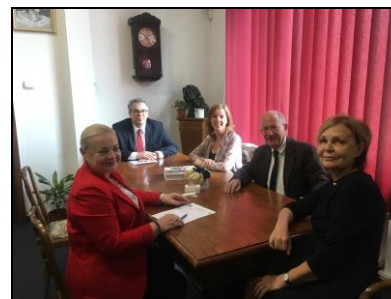
Meeting with Deputy Health Minister Mrs. Rodica Nassar

Also on the 6 th of May the IUSTI delegation had a meeting with Mrs. Rodica Nassar – Deputy Health Minister of Romania. The agenda included a discussion of the venereological realities in Romania. Both parties agreed to have those subjects covered by the IUSTI-Europe Congress 2020.