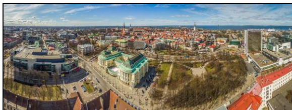
Estonian National Opera House, the venue of the Congress – panoramic view

other STI-related international conferences, and Congress materials have been distributed at even more events. The Congress has 20 supporters, among them two Platinum-level sponsors.