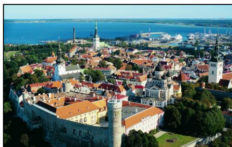
Tallinn Old Town – a panoramic view

Streetcar Named Desire", a bold new take on Tennessee Williams' legendary play.