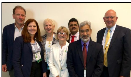
Speakers and Chairs of the IUSTI Sponsored Symposium

The new World Executive Committee met at the end of the Congress to discuss our strategic directions. These include closer collaborative working with WHO as well as maintaining our close relationship with ISSTD to enable the two societies to work together so we continue to provide very successful joint meetings. We also considered other issues such as potential ways of increasing our membership, both in numbers and geographical spread. I will expand on these in future Newsletters.