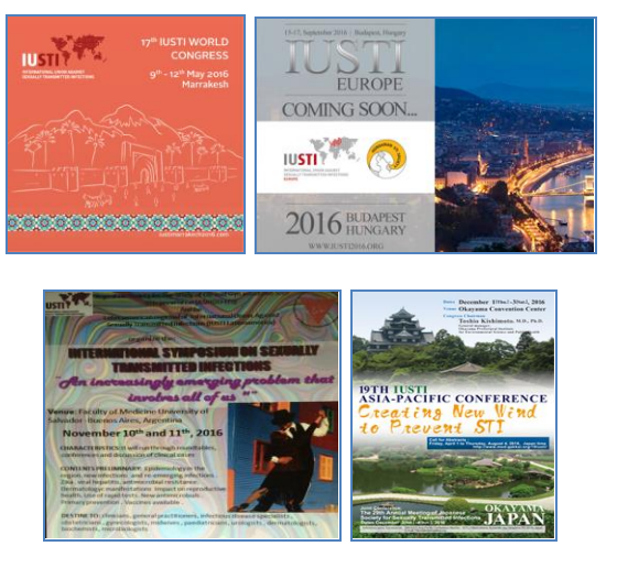
Figure 3: IUSTI World and Regional Congresses to be held in 2016: Marrakech, Morocco (May, top right); Budapest, Hungary (September, top left); Buenos Aires, Argentina (November, bottom left); Okayama, Japan (December, bottom right)

IUSTI's World and Regional teams continue to work as hard as ever to deliver a series of high regionally-relevant scientific quality and conferences. This year alone, there will be four The 17<sup>th</sup> IUSTI conferences. IUSTI World Congress will take place in Marrakech, Morocco, from 9-12 May (www.iustimarrakesh2016.com) and will additionally be an IUSTI-Africa regional meeting. The IUSTI-Europe meeting will be held in Budapest, from 15-17 September Hungary, (www.iusti2016.com). An International Symposium on Sexually Transmitted Infections, co-organized by the Argentinian Society for the Study of Obstetric and Gynaecological Infection and STI prevention (ASAIGO-ITS) and the IUSTI Regional Branch for Latin America and the Caribbean (IUSTI-LAC), will be held in Buenos Aires, Argentina, from 10-11 November (information available from asaigoits.ar@gmail.com). Lastly, the 19<sup>th</sup> IUSTI-Asia Pacific Conference will be held in from 1-3 December Okayama, Japan, (http://www.med-gakkai.org/19iusti). I would like to thank the numerous individuals who are spending many hours of their own time fund-raising for these events, organizing the scientific programmes and undertaking the local organizational activities required to make each of these educational and networking events a success.